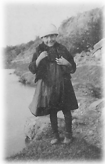
Pito in 1920