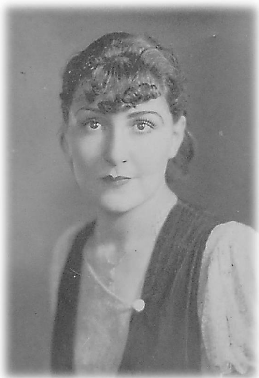
Pito in 1930