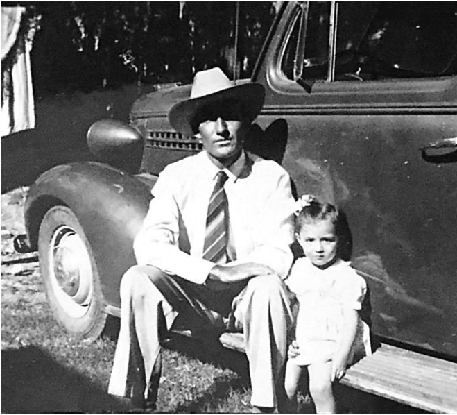
Daddy and me when I was 2 years old