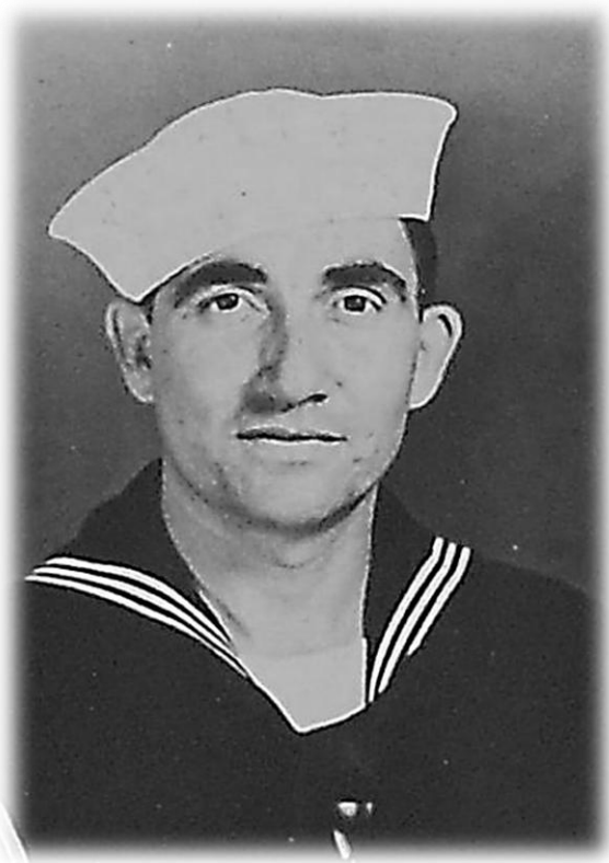
Charles USS Bismarck Sea (CVE-95) Carrier Aircraft Service Unit 2 Asiatic-Pacific Campaign Ribbon